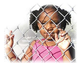
ST: Children and Families of the Incarcerated

This course will take an anthropological look at the paid and unpaid work that women and men perform in Western and non-Western cultures around the world. including the United States. The course will analyze the effects of gender on the work people do, and its rewards. hardships, and implications for family living. It will also consider how people's race, ethnicity, and class profoundly affect the shape of male and female labor. It will ask how work roles have varied throughout history, and how current economic and technological changes are affecting equality between women and men, here and abroad. We will examine historical and cultural context, empirical research findings, and theoretical developments as we study issues relevant to understanding women's and men's work experiences.