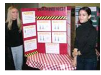
Previous Poster Session